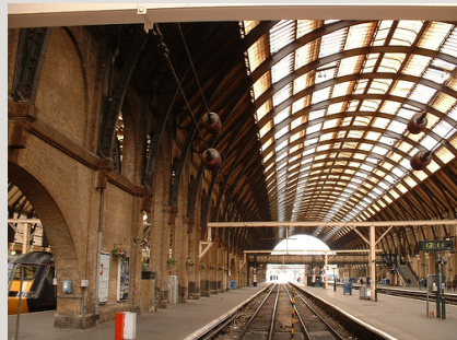
King's Cross train station