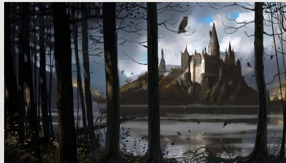
Hogwarts, school of wizardry