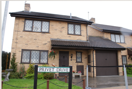
4 Privet Drive, Little Whinging